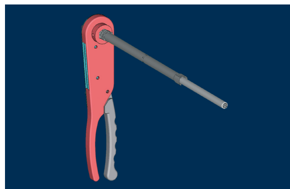
ProEngineer was used to design the surgical ratchet.