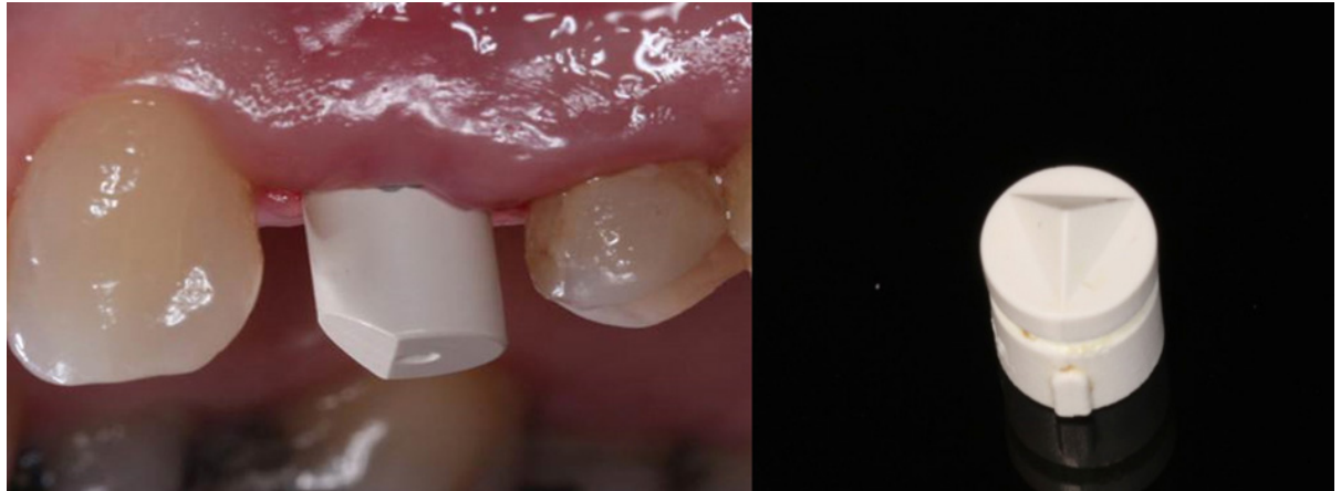
Figure 2: Examples of scan-bodies.

in the precise location of the implant within the patient's mouth. This model provides the location and surrounding dental topography. A scan-body is then placed in the analog and the model is scanned with a laboratory model scanner. An abutment design module, within the dental CAD software, identifies the implant depth, angle and position thereby allowing the custom abutment design to follow.