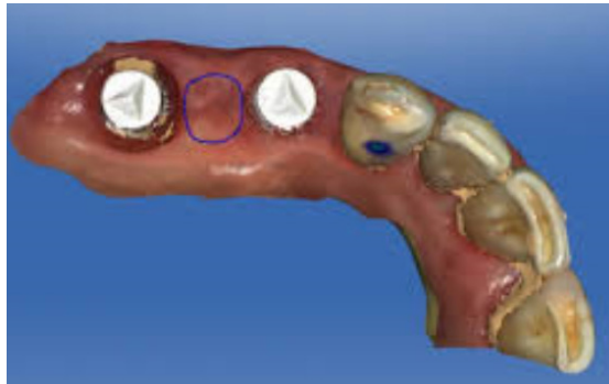
Figure 4: Abutment bridge with CEREC

need for optical spraying. Then, a color-anodized titanium interface makes the implant/analog connection durable so that it can be used repeatedly and its color-coded scan flags can choose the correct scan flag for the correct implant size. Finally, a titanium screw is integrated into the PEEK cylinder to ensure that the screw is not lost. What's more, the same screw is used for all implant sizes and systems, so separate screwdrivers are not necessary.