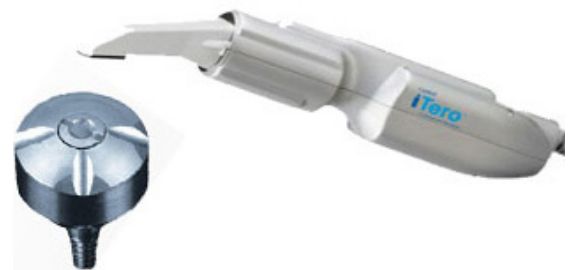
Figure 1: Biomet/3i Encode abutments

After an implant has been surgically placed, a recovery period is usually necessary. Healing abutments are placed to maintain the implant out of occlusion, allowing the implant to integrate with the bone. They are also used to help contour the surrounding tissue and ensure proper gingiva contours. To translate the location, angulation and gingival contours of implants to the CAD software, Biomet3i has introduced their Encode® line of healing abutments.