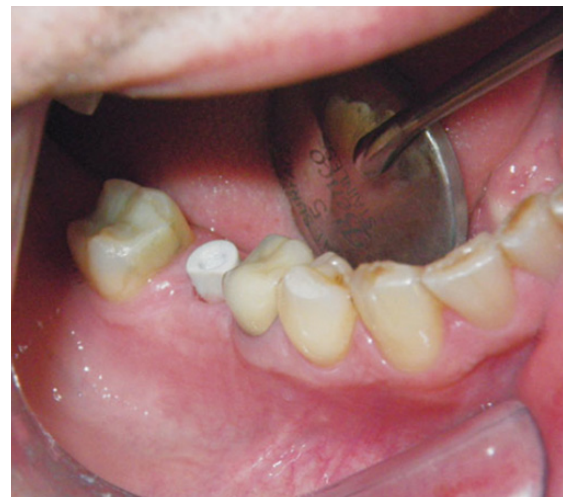
Figure 3: Abutment scan-body

The Elos Accurate utilizes three unique components. First, a PEEK cylinder with excellent optical properties makes the geometry easily recognizable to the scanner and eliminates the