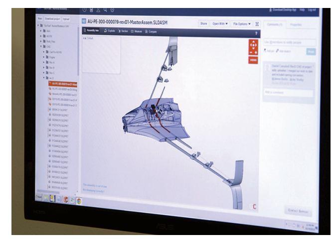
GrabCAD allows for collaboration and quick iterations in designing complex, highly functional components.

This design freedom allowed engineers to very accurately position the center of gravity, a key parameter for blended wing body aircraft.