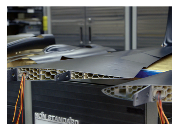
Internal wing design, optimizing complex internal structures, for lightweighting aircraft.