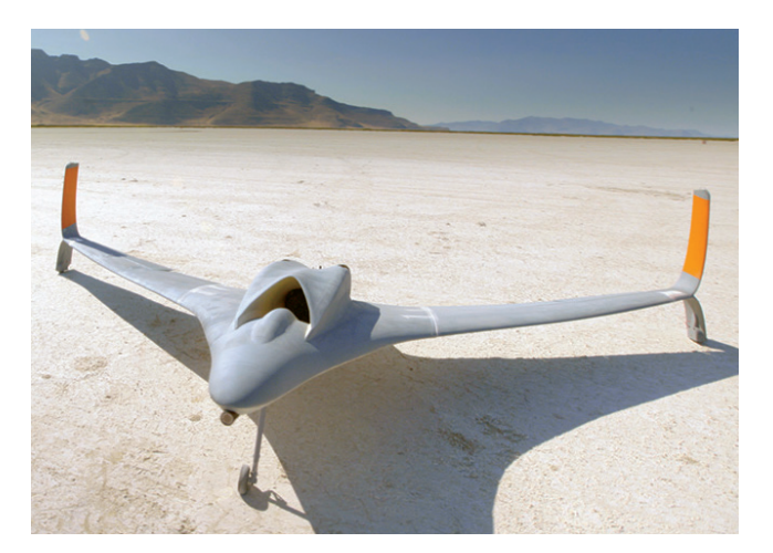
Final 3D printed jet-powered aircraft.