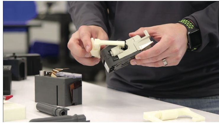
Several of CSI’s 3D printed manufacturing aids

CSI’s innovative drive and strong partnership with Stratasys reseller AdvancedTek has expanded their utilization of 3D printing across all facets of their business. PolyJet™ technology’s versatility to print in multiple colors and textures is what enables CSI to create such realistic vessel models and analogues. The combination of both PolyJet and FDM® technology and CSI’s innovation greatly benefits patients through successful treatment of atherosclerosis.