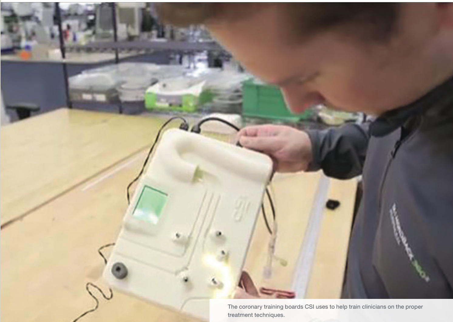
The coronary training boards CSI uses to help train clinicians on the proper treatment techniques.

“It's a great way to get instantaneous feedback,” said Draxler. “We've also experimented with multi-colored, multi-layered materials. As our device removes simulated lesion material, we can easily see and measure how far into the multicolored layers it's orbiting.”