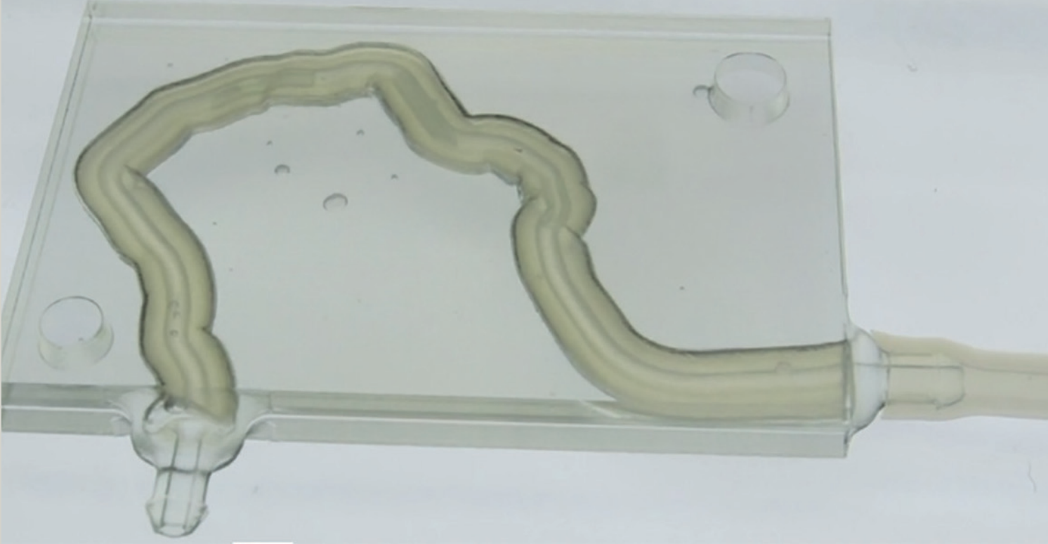
CSI 3D prints coronary blend plates using flexible 3D printing material.