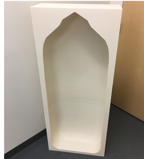
The 3D printed lay-up mold for the main sled pod, made with ASA thermoplastic.

Using 3D printed composite lay-up tools saved USA Luge five months in the development of a single sled – from six months down to four weeks. With an off-season that is only five months long, this gives USA Luge much more time to build, test and validate multiple designs. 3D printing's design freedom also makes the low quantities and high customization much less costly than traditional lay-up tooling methods.