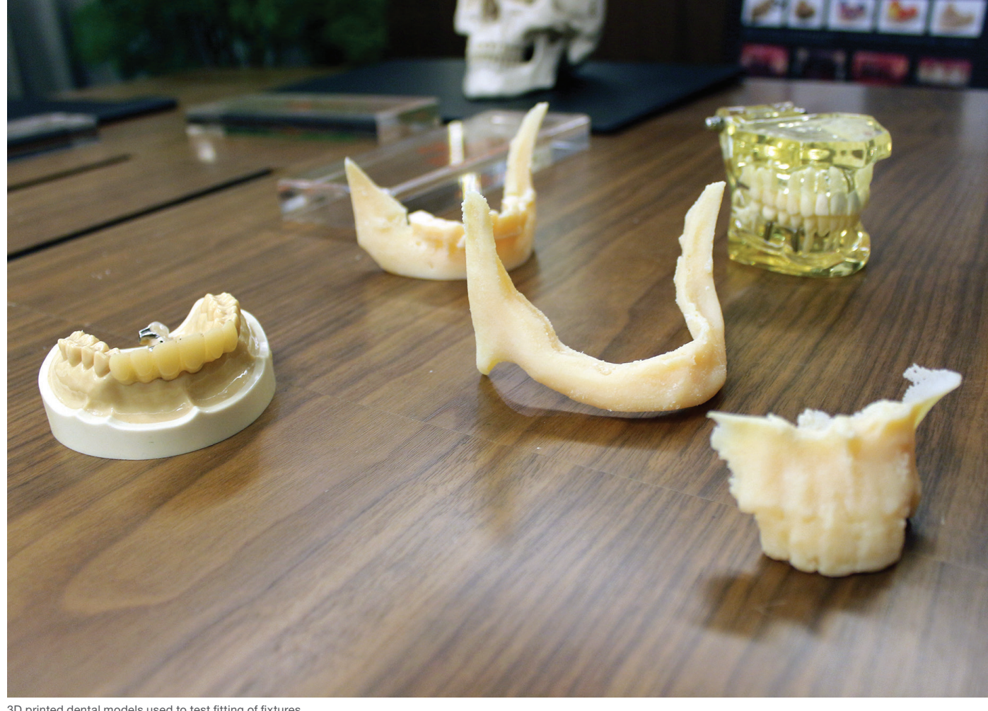
3D printed dental models used to test fitting of fixtures