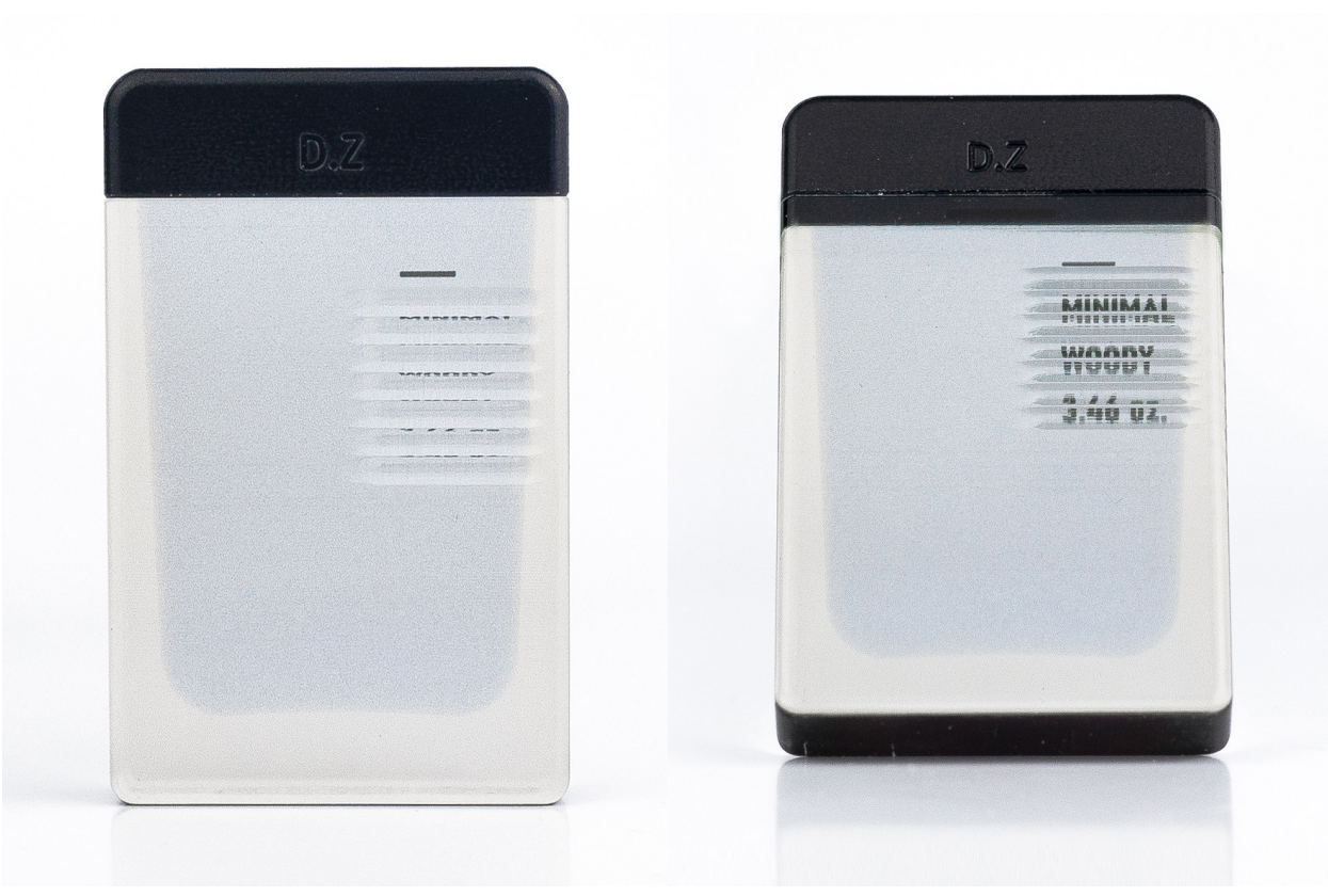
Lenticular 3D printing allows for packaging designs like nseen: a perfume bottle that displays critical information within a transparent, minimalist design

"It's sort of like embedding time sequences into the material – we had to dive into the voxel level to achieve those interactive results," Deng explained.