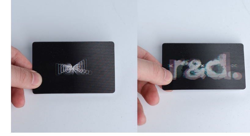
Traditionally, lenticular designs were limited to 2D layouts, like this business card with shifting text.

"We wanted an end product that produced a dynamic experience, where the illusory design was purely physical and embedded into the model," said Zeng.