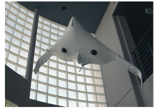
Swift uses composite parts for innovative aerospace applications to reduce weight.

Nate Ogawa, Swift's director of product development services, adds that this is "critical for the optimum inner surface quality of the part and means that functionality is improved, compared with traditional sacrificial tooling methodologies that use multiple parts bonded together to achieve the same shapes."