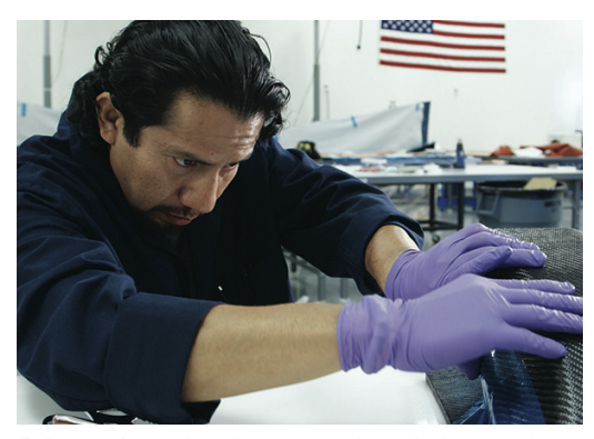
Prior to bagging for cure, the ply lay-up is completed.