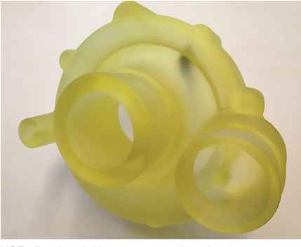
VCE 3D printed this water pump housing in Transparent material for quick functional testing.

"3D printing will make it possible to build mock-up engine components so the platform and manufacturing teams can provide feedback at a much earlier stage in the development process," said Jeff Hartman, Product Designer for VCE. "This should reduce risk of errors and the need for changes at all stages of the development process."