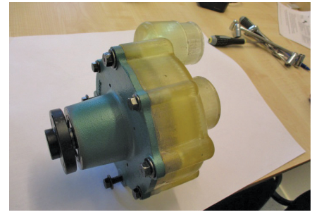
Housing installed on a water pump.