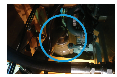
Water pump installed in an A30G for functional testing.