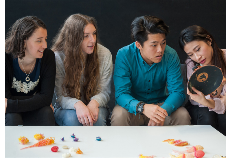
Industrial design students examine the 3D printed chalice kylix bowl replica

To other schools considering 3D printing, Stevens believes the best is yet to come. "Goodness knows what Stratasys will come up with over the next few years. Is it reactive materials, bio-printing or perhaps adding an electrical current that will make the printed objects move?" Stevens said. "The possibilities are virtually limitless."