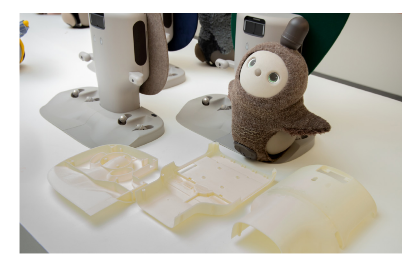
Not only LOVOT's main unit, but also its larger charger is prototyped by a 3D printer.