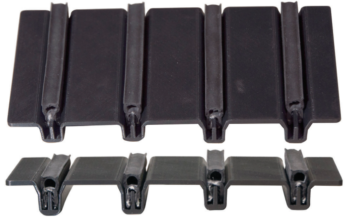
This FDM part (top and side view) allows testing of four variations of a groove that mates with a rubber seal. The finished HVAC system housing (below) features three FDM parts.

“The Stratasys solution of being able to make production-grade components one-off enables us to deliver functional prototypes to customers at a much faster speed,” Hansen concluded. “FDM prototypes are more useful than the SLA and SLS prototypes because they can be used for physical testing and even given to customers as components on valuation units. This means that we are nearly certain to get the design right the first time so we can keep customers happy and start generating revenues sooner.”