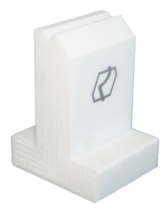
A 3D printed die used for specialized molds that eliminate the risk of unsightly marks on the metal sheets.