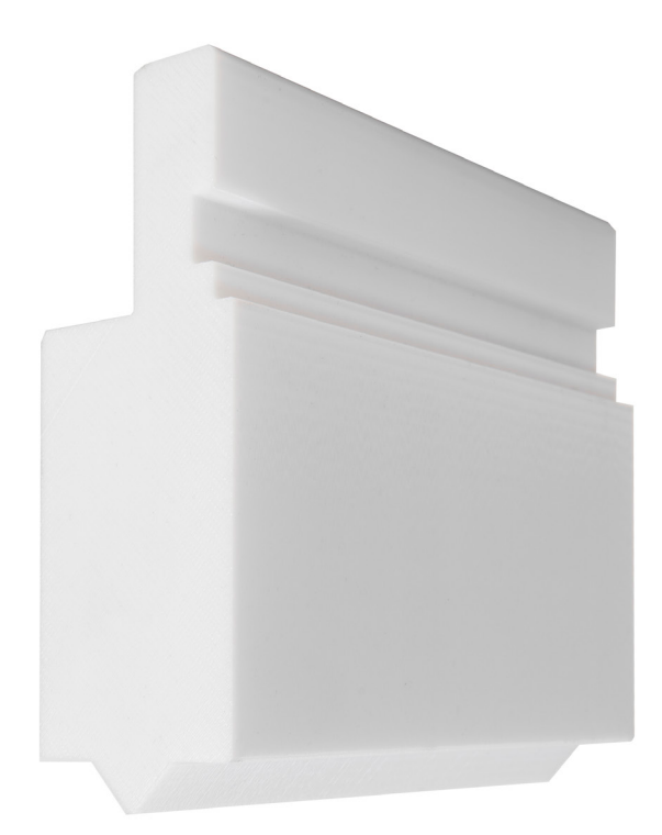
A 3D printed mold designed to produce a V-fold. The mold is currently in use within Rolleri's customer's production floor.

"In addition to supporting the requirements of the customer, we're getting even more ROI from the Fortus by using it to boost our own internal production efficiencies," he says. "The clamping systems are a prime example. Previously, we would outsource these tools to be machined, which is costly and requires long lead times. When we needed to modify the design, we had to go through the same costly cycle again. With our 3D printer, we can iterate the design of the mold as much as we want and 3D print them on-demand, which has transformed the way our operators work and given them the confidence to be creative with their tool design."