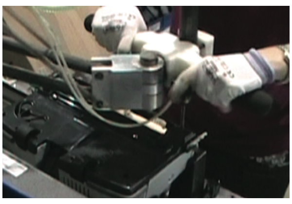
The bottom cover is then positioned and fastened down.