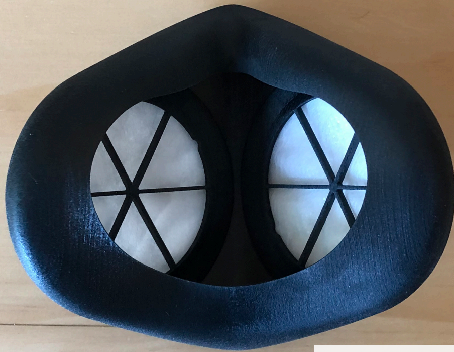
Multimaterial B2 respirator prototype 3D printed with Agilus30.