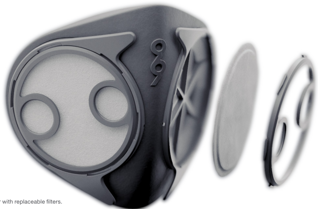
Breathe99 B2 respirator with replaceable filters.

The original respirator design – the B1 – was a good starting point, but needed several improvements to make it suitable for mitigating the spread of infectious disease. The new design incorporates elements of industrial respirators, such as two filtering elements and an ergonomic seal to ensure the only air flowing in and out goes through the filters. However, the B2 mask uses unique flat filters that help keep the design lightweight and wearable. The filters are also the only part of the mask that need to be replaced, which helps reduce ongoing costs and waste compared to alternative PPE options.