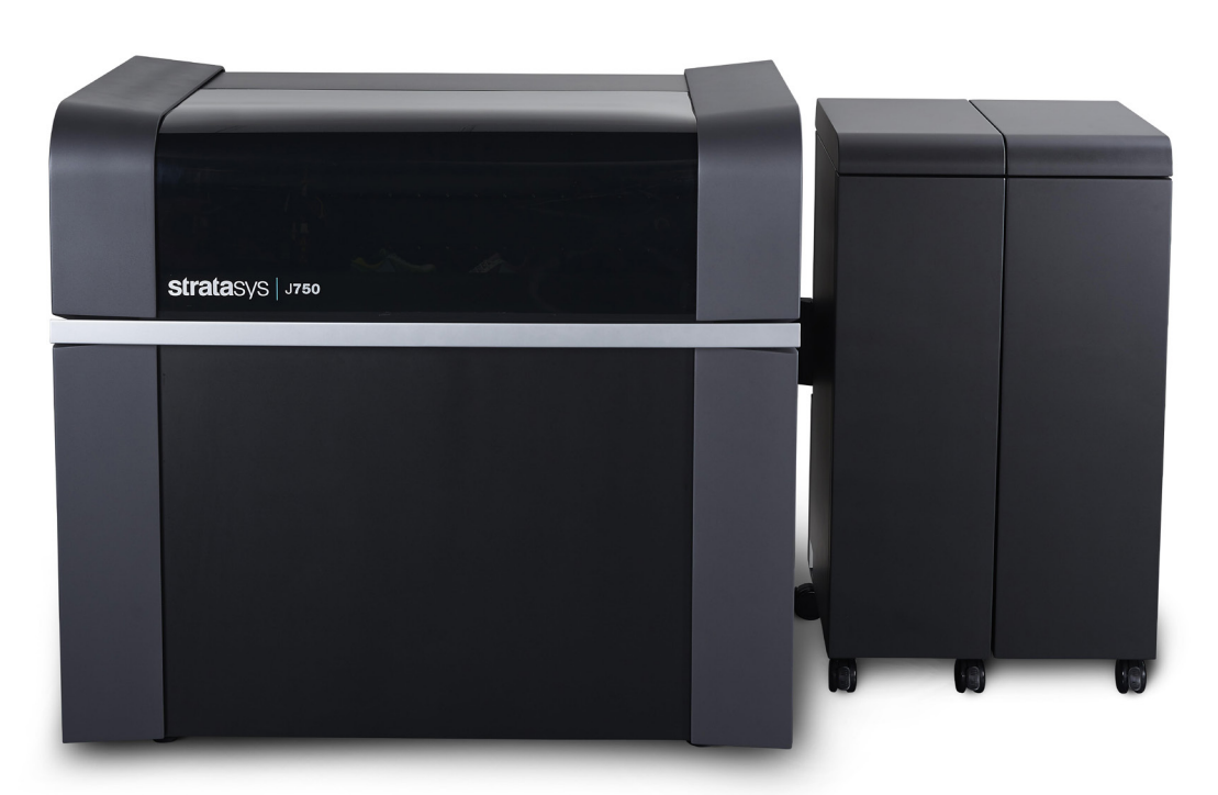
The Stratasys J750 — a full color, multimaterial 3D printer.

"With this comes the inevitability of human-error and the inability to recreate detail and color, one hundred percent of the time. Using the J750, the team is able to create attention-grabbing models using vivid colors and with a previously unattainable accuracy and repeatability. The vibrant models produced using Stratasys 3D printing perfectly represent what we would like the final toys to look like," he added.