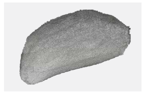
Point cloud data of the donated patella.