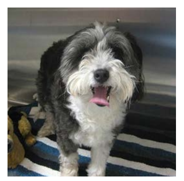
Oreo enjoying the use of his new implant.