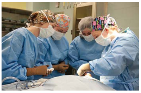
Operation during which Oreo's FDM patella was implanted.