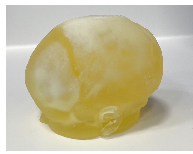
Craniosynostosis Prototype Model created using Bone Matrix and Tissue Matrix Material - Side View.

To achieve that goal the hospital acquired a Stratasys J750™ Digital Anatomy™ 3D printer to augment its simulation center. The printer, combined with the Digital Anatomy software, is able to create incredibly realistic anatomical models. To achieve this level of realism, the Digital Anatomy printer makes use of several special materials designed to mimic human bone and tissue: BoneMatrix™, GelMatrix™ and TissueMatrix™. The software leverages these materials to enable over 100 sophisticated anatomical presets to produce models that demonstrate clinically validated realism in both feel and biomechanical performance.