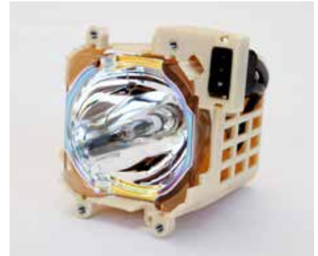
This FDM lamp assembly in ULTEM 9085 resin thermoplastic withstands high temperature.

"We have had a mindset change with our engineers. Now they are not willing to live with one prototype and hope it works. They are iterating daily to make sure they are getting the most optimum design," Barfoot said.