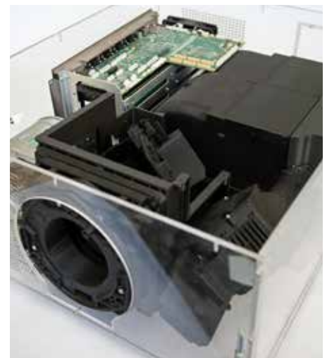
This mockup projector has a combination of 3D printed and production components.