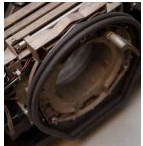
Lens mount boot with rubber-like properties